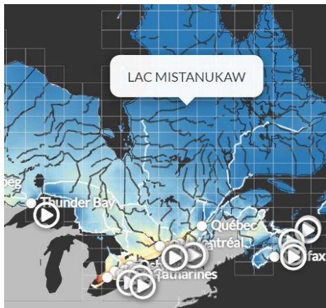
Figure 2-1 Lac Mistanukaw grid cell Lac Mistanukaw’s coordinates are approximately 54.7779, -72.6324, which are encompassed in the grid cell.

For this climate portrait and assessment, data for multiple climate parameters are retrieved from the Prairie Climate Centre’s Climate Atlas of Canada (2019). Unless otherwise indicated, they are from the large Lac Mistanukaw grid cell, which was selected to represent the study area’s climate because it is relatively central (Figure 2-1).