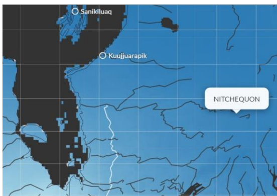
Figure 2-3 Kuujjuarapik and Nitchequon climate stations

Intensity-duration-frequency (IDF) curves provide a good representation of extreme rainfall events. Historical IDF models calculate 17 mm of precipitation in 15 minutes and 72 mm in 24 hours in La Grande Alliance study area, both with a 50-year return period, which is a 2% likelihood of occurring each year (University of Western Ontario et al., 2022). Although these amounts are modelled for a coastal climate station in the region (Kuujjuarapik), model outputs from an inland station (Nitchequon) are similar (suggesting the coastal influence on precipitation regimes in La Grande Alliance study area is minimal).